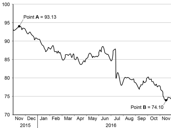
Figure 1: Sterling effective exchange rate index, November 2015 to November 2016